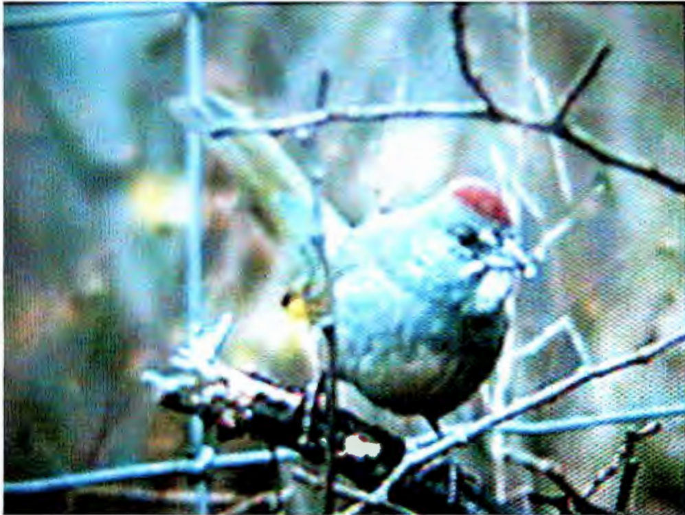
A second photo of the Green-tailed Towhee taken with a digital video camera.